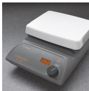
Model PC-400D shown