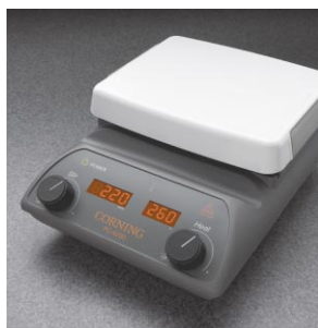
Model PC-420D shown