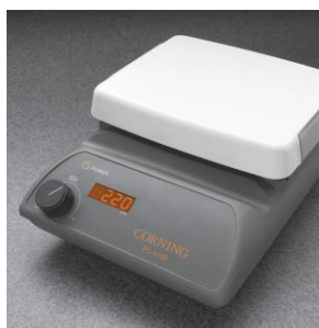
Model PC-410D shown